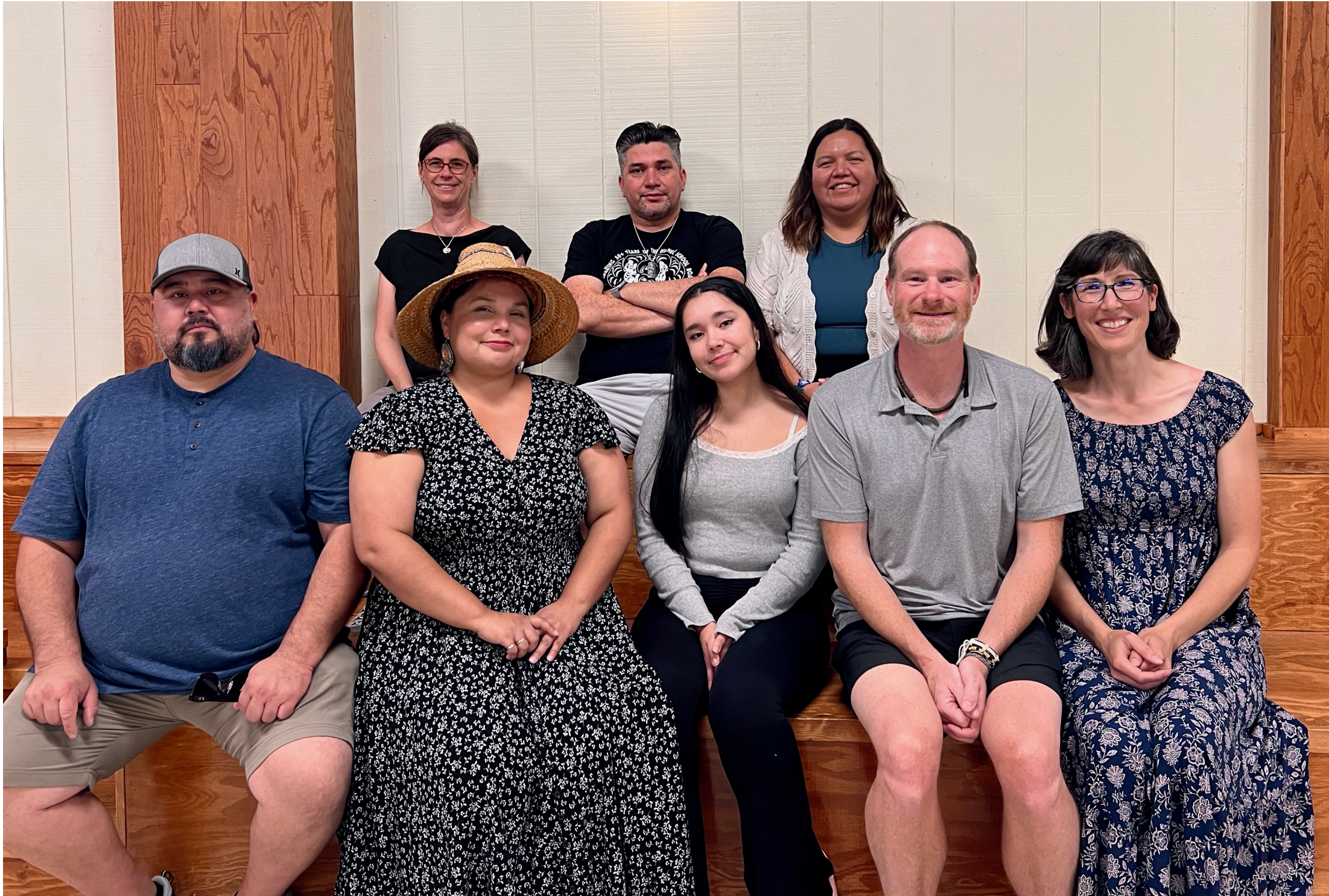
W,SENĆOŦEN IST and UVIC administrative and teaching team celebrates the start of the fifth cohort of SENĆOŦEN language learners in community with a new student, TOLISIYE.

Together, we have supported the renewal of SENĆOŦEN language and built local teaching capacity. Today, every teacher in the WSÁNEĆ immersion program is a graduate of this partnership—an enduring example of education grounded in reciprocity and self-determination.